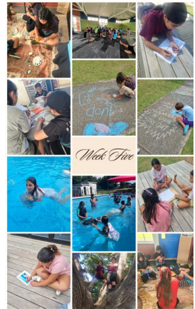
Week 5 IHAD Activities